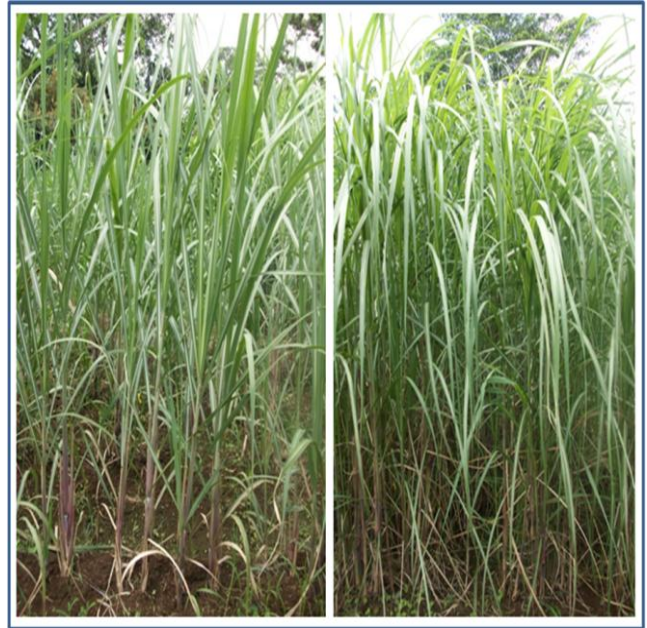
Figure 1. Phenotypical differences in stalk number, height, thickness and in leaf number and area between a commercial sugarcane var. Pindar (left) and an energycane clone US 88-1006 (right).

Mediterranean conditions (Mack 2008, Matineo et al. 2009), showed very poor growth and yield. During the growing season, differences in leaf area index (LAI) and stalk number per unit area reflected the differences that were later observed in fresh weight production. Therefore, these two indicators could be useful for germplasm selection programs.