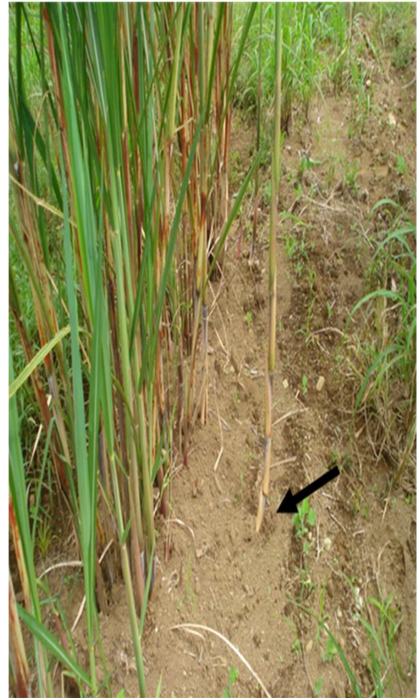
Figure 4. Lateral vegetative growth of energycane (indicated by the arrow) grown under tropical conditions in Limón, Costa Rica in 2010.