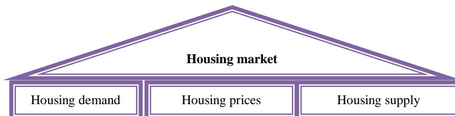
Figure 2. Housing market elements (Averin, Babich, Berestova, 2016; Bobyleva, 2016)

The development of the market mechanism elements of the real estate market depends on a large number of factors, among which price, demand, and supply are in the first place.