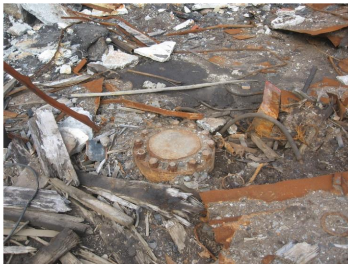
Figure 4. Mothballed opening of the SG-3 borehole