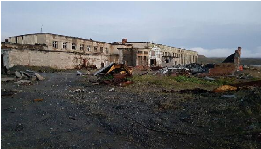
Figure 3. Ruins of the Kola Superdeep Borehole site facilities

In 1983, one of them reached a depth of 12,066 m, but the drilling was temporarily suspended as the state was preparing for the International Geological Congress, which was to be held in 1984 in Moscow. Continued on September 27, 1984, the drilling experienced an accident on the very first run: the drill string broke off again. The operations resumed from a base depth of 7,000 m, and by 1990 the SG-3 parallel borehole had reached a record depth of 12,262 meters. The SG-3 team was preparing to reach a depth of 14 km, but the drill string broke off again, and then the drilling was stopped by government decision. In 1991, the project received the status of the Federal Research Center (Kola Science Center). In 1995-2007, the Center was operating as the site for the Russian Deep Geo Lab. At this time, it was actively used as the basis for studies conducted by more than 20 countries under UNESCO and the International Geological Union international projects. In subsequent years, the site of Kola Lab was operationally closed due to financial difficulties and a lack of state support. Still, the projects for further development could bring the country huge profits at relatively low costs: by the closing time, the annual budget of the Center was 3 million rubles. In 2008, SG-3 was mothballed; the equipment was partially dismantled, and partially plundered for scrap, the tower itself and production facilities turned into ruins (Fig. 3.4).