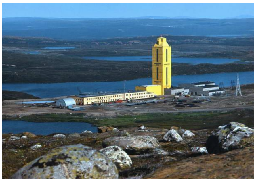
Figure 1. Kola Superdeep Borehole (SG-3)

The Academy of Sciences of the Soviet Union recommended that SG-3 should be drilled in the Pechenga ore region, where the largest Cu-Ni ore deposits in Europe were formed. The borehole was located 10 km southwest of the town of Zapolyarny (69°23'46" N, 30°36'31" E). Sited in the northern flank of the Early Proterozoic Pechenga structure, SG-3 uncovered sections of Proterozoic rocks with an age of 2300-1900 Ma and located deeper than Archean rocks of a granite-gneiss basement with an age of 3100-2800 Ma (Kozlovsky, 1984). Eighteen research institutes and more than fifty large industrial enterprises took part in the preparation and organization of drilling. All the mechanisms and materials were of domestic origin. Three thousand participants joined the Kola geological exploration expedition. A powerful modern enterprise emerged in the deserted tundra, with a large complex of buildings and facilities, including residential premises, a dining room seating 220, and a medical center (Fig. 1).