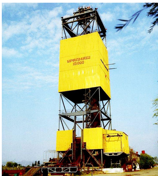
Figure 2. Uralmash-15000 drilling rig

The SG-3 rig was a high-tech facility with a powerful foundation on which a sectional 74-meter tower was erected. The facility was equipped with state-of-the-art means for drilling, lowering, and lifting a drill string, holding the entire pipe string during tripping and drilling (Kozlovsky, 1984). Numerous technical and electronic developments ensured the safety of drilling. The inner space of the tower housed power and technological equipment, power generating and pumping units, automated drilling control, and lab equipment complex. When drilling the SG-3, the latest measuring instruments were used to control a wide variety of processes, from the surface to the very bottom of the borehole. Regular logging with instruments run into the borehole on heat-resistant wireline proved to be ineffective. Employed modern compact telemetry and electronic sensors were finally able to move from depth in a stream of mud, delivering to the surface the measurements of various physical properties of deep rocks.