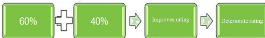
Figure 3. Structure of the rating model (PD)

The credit rating system provides a differentiated assessment of the probability of non-fulfillment / improper fulfillment by counterparties of their obligations based on an analysis of quantitative (financial) and qualitative (market factors and external influence factors, management quality characteristics, business reputation assessment, etc.) credit risk factors, the degree of their impact on the counterparty's ability to service and repay the obligations assumed.