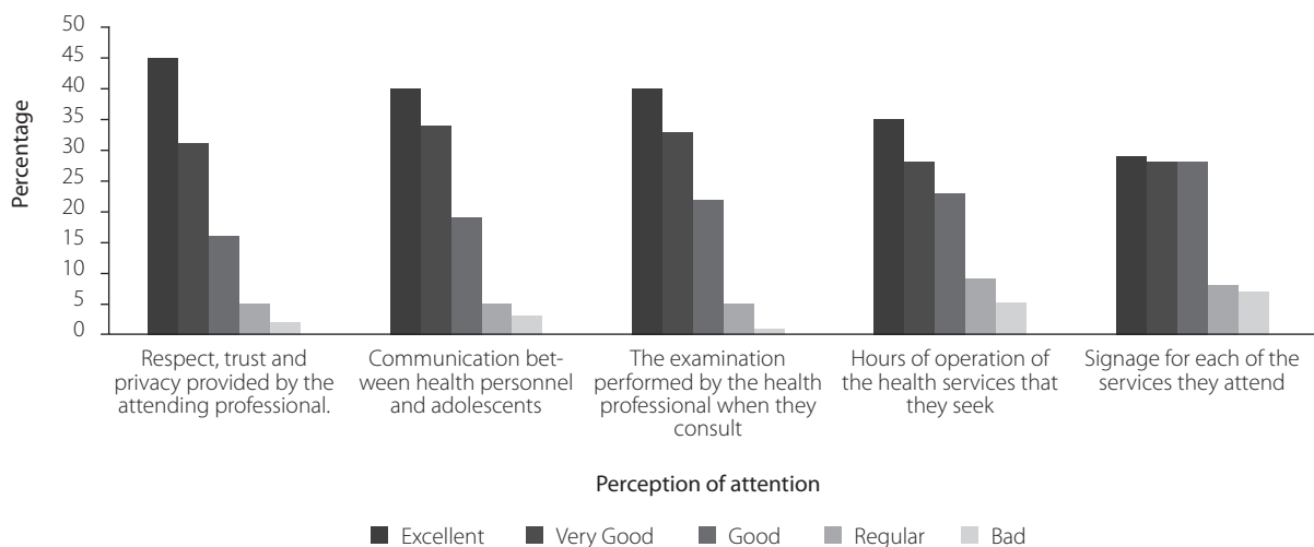
Figure 2. Youth evaluation of user experience according to the accessibility of services/programs in the health unit, 2020

Regarding the duration of waiting for consultation with a medical, dental, nutrition, or psychology professional, 39.7 % of respondents reported that the wait was between 30 and 60 minutes, while 17.6 % reported that the wait was longer than two hours. For care in support areas, such as file preparation, laboratory, or radiology, 48.7 % of respondents reported a waiting time of 30 to 60 minutes, while 6.3 % reported a waiting time exceeding two hours.